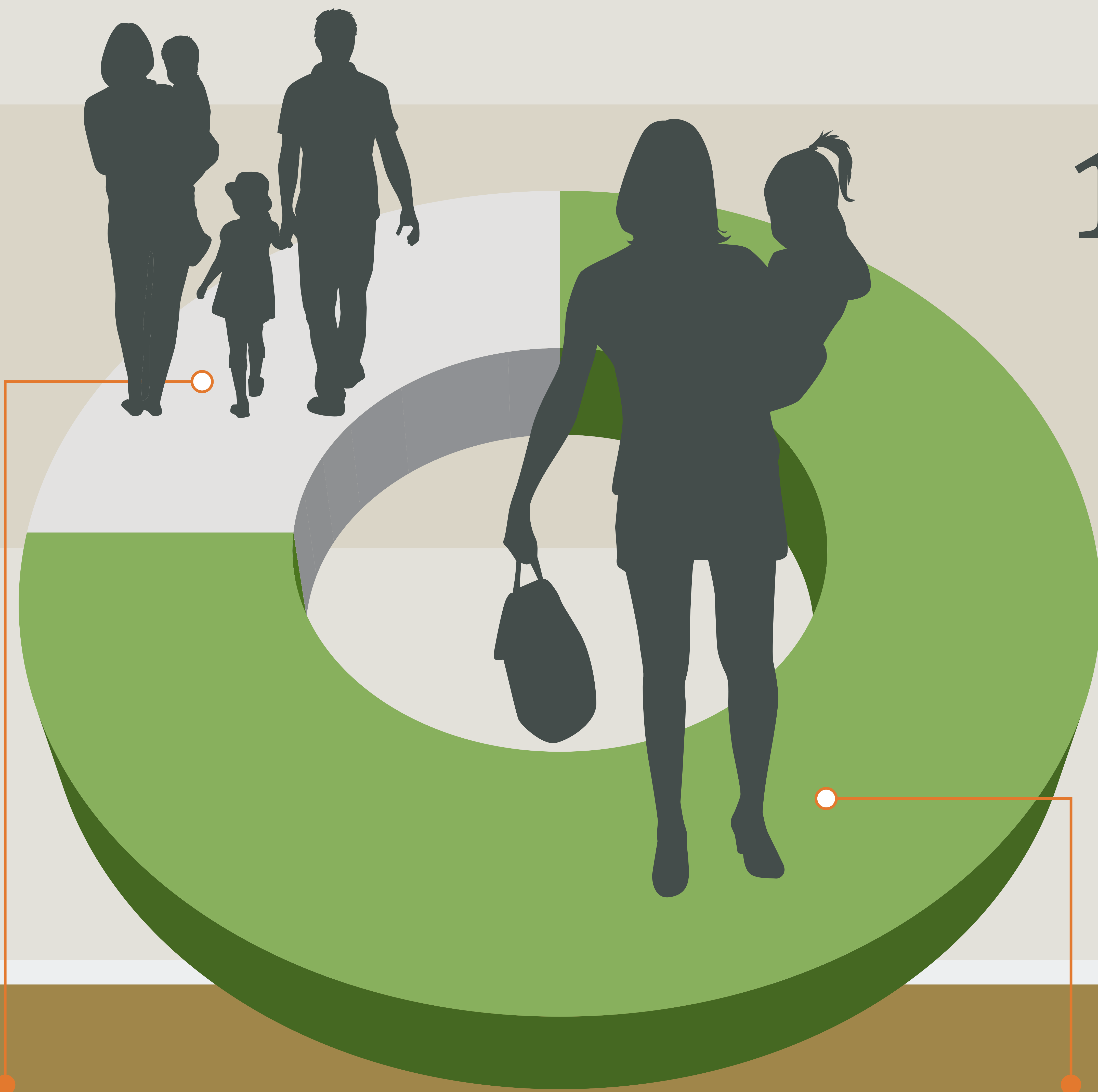
Family Status of Children Living in Poverty in Cowley County, 2016-2020 5-Year Estimate

17.8% of children in Cowley County live below the Federal Poverty Level (FPL)