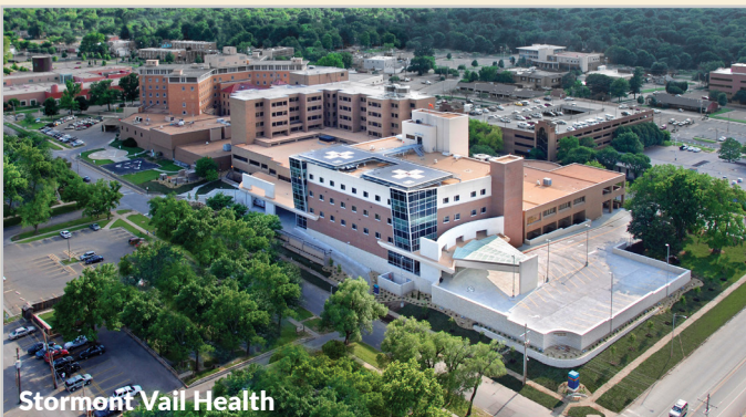
Stormont Vail Health

To identify community issues, Stormont Vail Health used heat maps, a flexible data visualization tool.