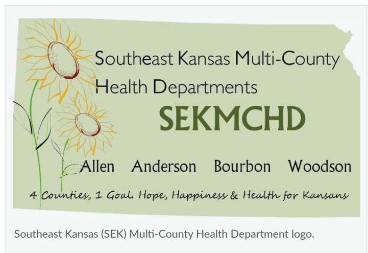
Southeast Kansas (SEK) Multi-County Health Department logo.

They also are strategically reconsidering the mix of services they offer. For example, they want to focus on services and programs that fill needs in the community that no other providers are currently filling—like WIC and the Healthy Start Home Visitor program. And, they want the public to know about the extra value they provide in all of their services. For example, people who come in for vaccines or