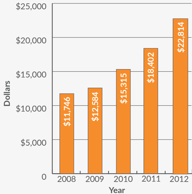
Figure 3. Average Annual Costs Per Enrollee in the KHIA Plan, 2008–2012